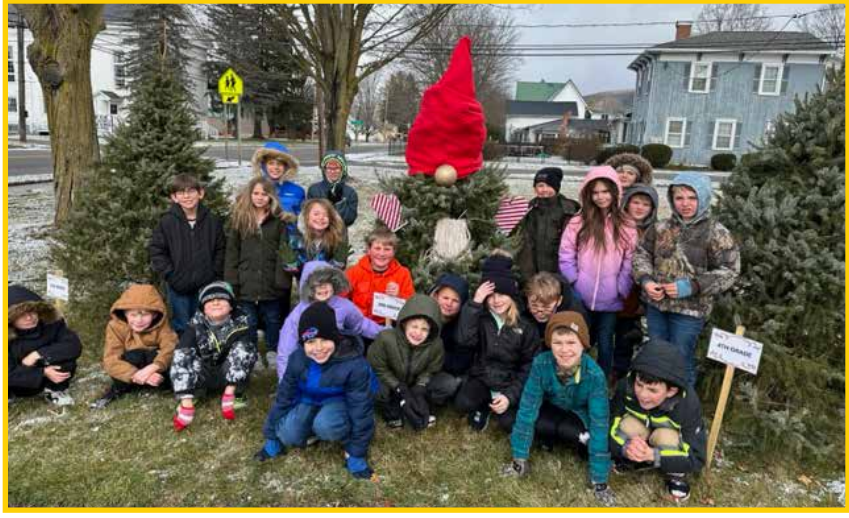
3rd Grade Class Tree