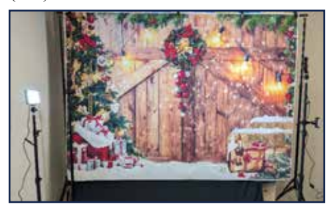
Here are some upcoming events:

Don't miss out on capturing memories, with the new photography area in the library. There are plenty of backdrops to choose from, including: holidays, family pictures, senior portraits, and birthdays. Learn more by calling (585) 593-4816.