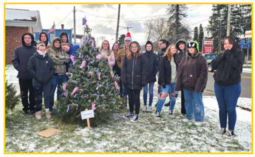
Senior Class Tree